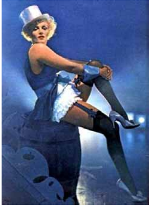
Marilyn Monroe featuring Marlene Dietrich in Life Magazine 1959

If you find more icons do send us a jpeg. We'll be happy to publish these photos.