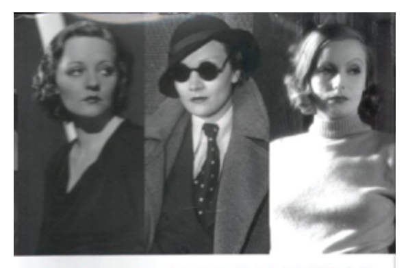
SAPPHO GOES TO HOLLYWOOD